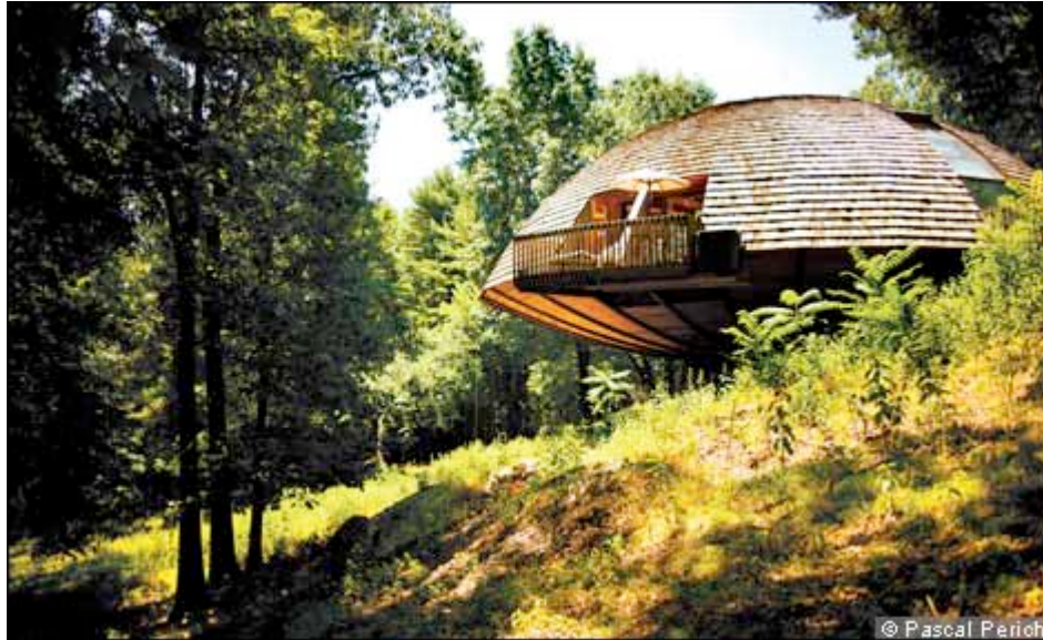
The exterior of Shiva Vencat's rotatable Domehouse in New York

Published: July 16 2010 17:05 | Last updated: July 16 2010 17:05