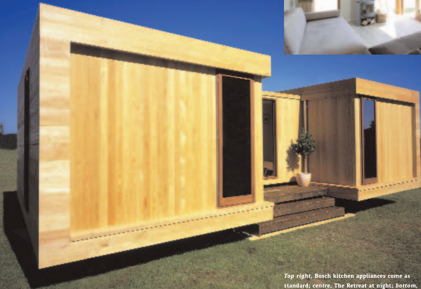
Top right, Bosch kitchen appliances come as standard; centre, The Retreat at night; bottom, the open-plan living area. Right, a two-bedroom model will debut at 'Grand Designs Live'